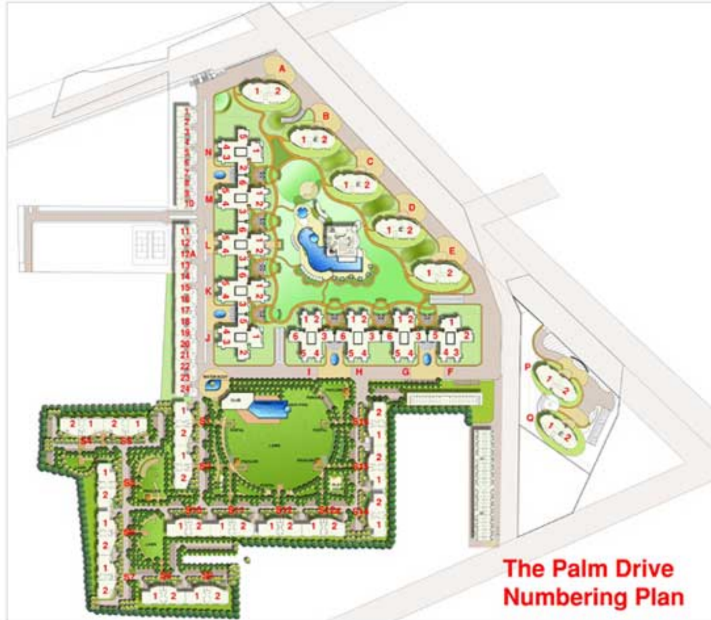
The Palm Drive Numbering Plan